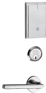
IN100 Commercial Lock