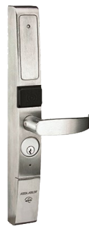
A100 Keyless Entry Lock for Aluminum and Glass Doors