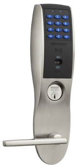
PR100 Institutional Lock

To view the complete line of Aperio products, visit intelligentopenings.com/Aperio .