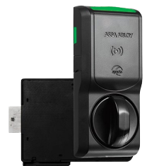
K100 Cabinet Lock

©2026 DAQ Electronics, LLC. All rights reserved.